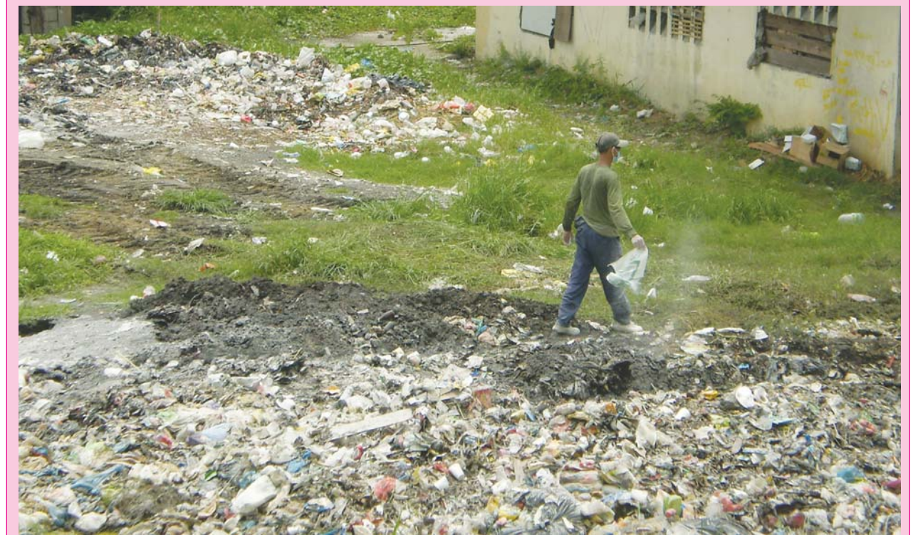
Sinabuyan ng apog ng lalaking ito ang mga basura sa open dumpsite sa likod ng Bulacan Medical Center upang hindi langawin at mabawasan ang mabahong amoy.

Deputy Information Officer PAGE 6 PLEASE