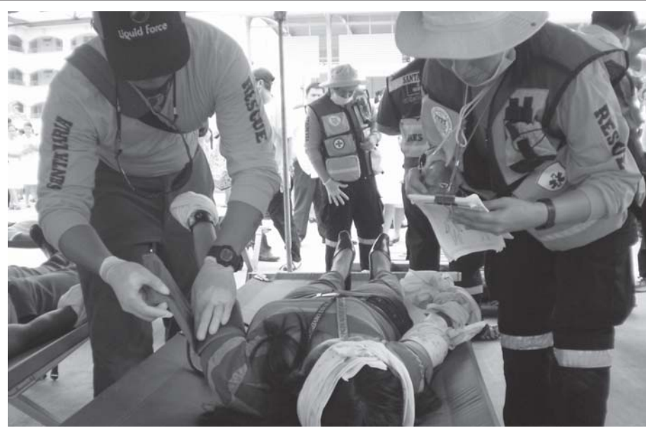
Members of the Sta. Maria town rescue group attends to the needs of a student of played the role of an injured victim during the simulated earthquake drill at the Bulacan State University in Malolos City yesterday.